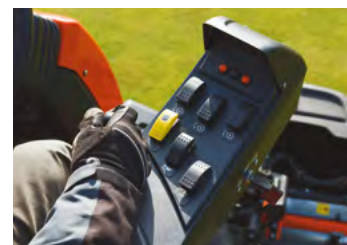
Programmable frequency of clip