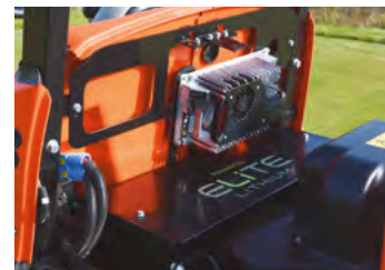
ELITE lithium battery & on-board high frequency 18 amp, 48V DC output, 85 - 265V AC 45 - 65 Hz input