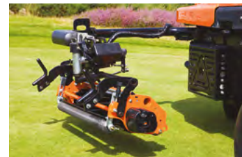
Easy access swing-out centre cutting unit

New linear actuators with exceptionally long life