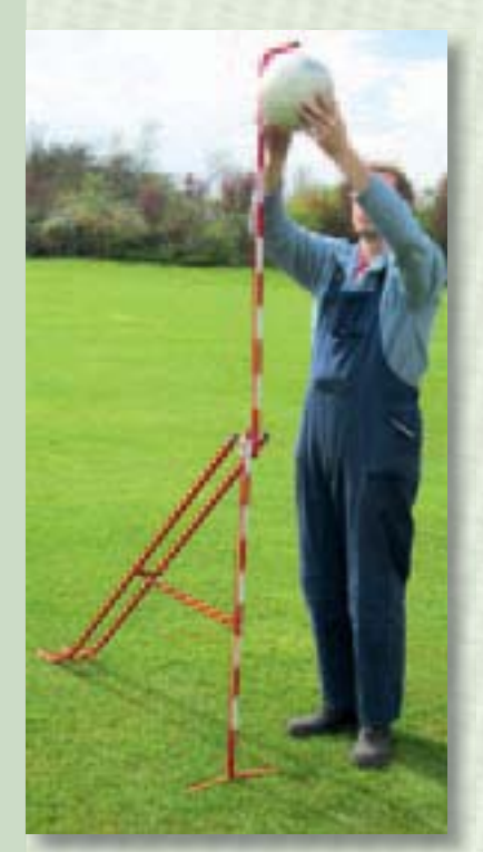
Ball Rebound Testing Bar

This device measures how far the ball rolls, and how high it bounces and gives an indication on what kind of maintenance is needed.