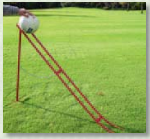
Ball Roll Tester