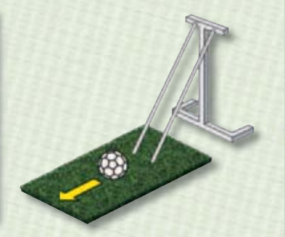
The Ball Roll values for natural turf would vary between 4- and 10m, natural turf in ideal conditions will give values from 4- to 8m. The lower the value, the slower the pitch.*